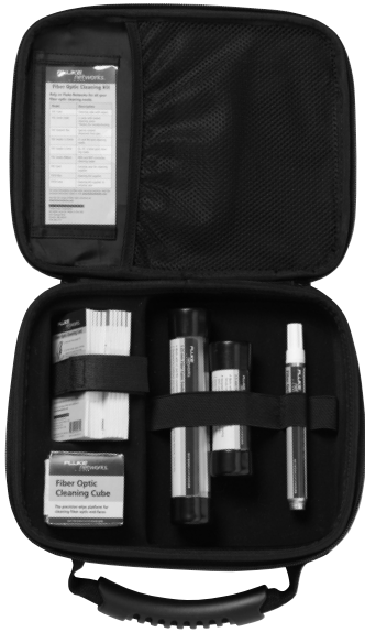
Fiber Optic Cleaning Kit NFC-Kit-Case