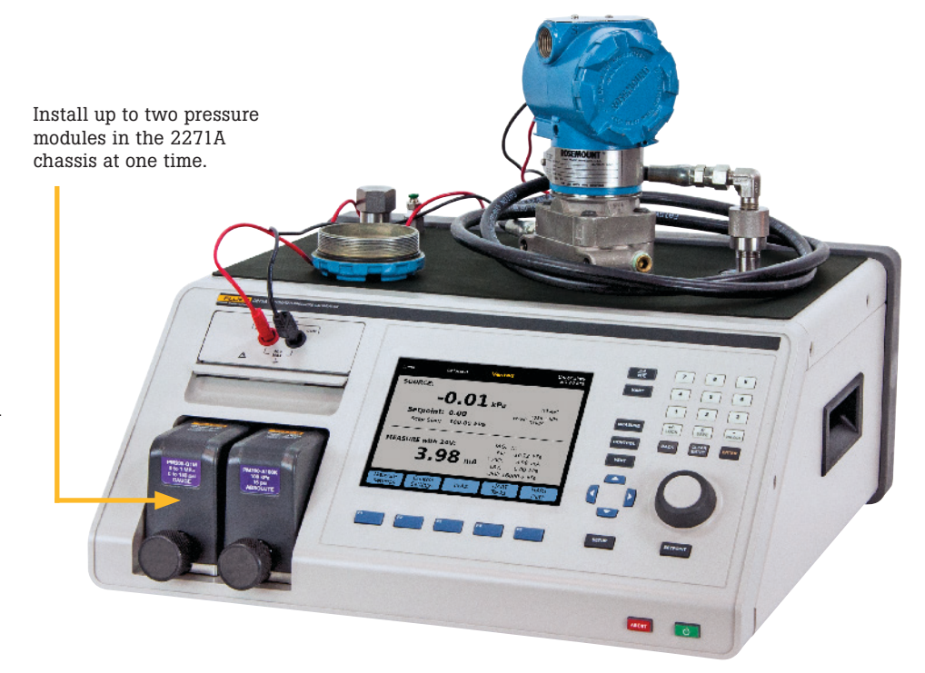
Use the 2271A to perform closed loop, fully automated calibration on 4-20 mA devices like this transmitter.

The 2271A accuracy specifications are provided in full and supported by a technical note that details its measurement uncertainty so you know exactly what you are getting. This technical note is available for download on the flukecal.com website. As with all Fluke Calibration instruments, these specifications are conservative, complete and dependable.