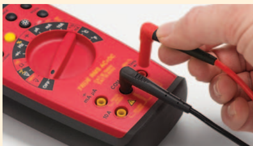
Universal plugs compatible with all 4 mm shrouded inputs