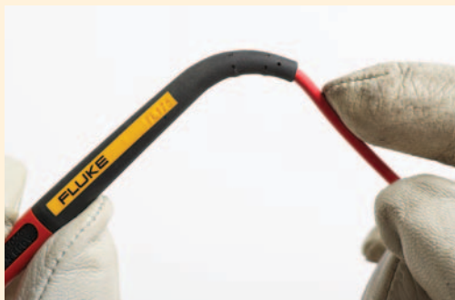
Extreme strain relief tested to withstand over 30,000 bends