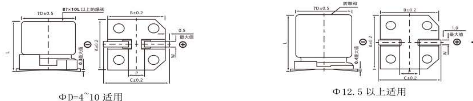
Diagram of Dimensions 尺寸图