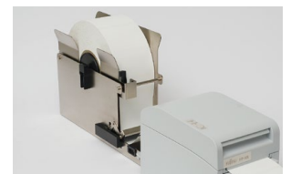
<FP-32L with roll paper unit>

“Roll Paper Unit”(option) can help to print for roll paper with big diameter up to 200mmΦ.