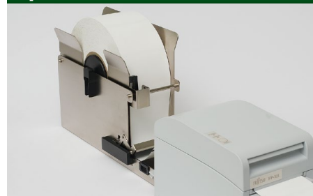
*FP-32L with Roll paper unit