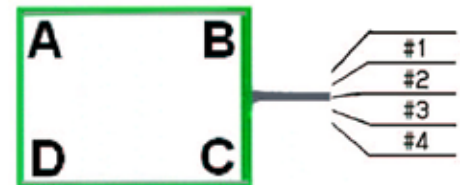
Origin (0,0) Point