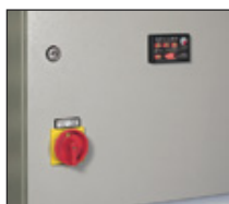
Front view of a cabinet with the display unit, easily visible, mounted on the front of the door, whilst the protector unit is installed deep within