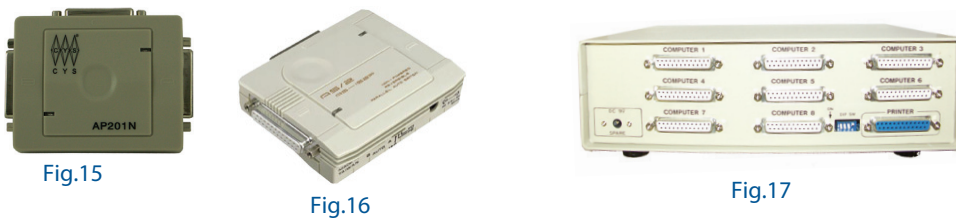
Fig.15 Fig.16 Fig.17