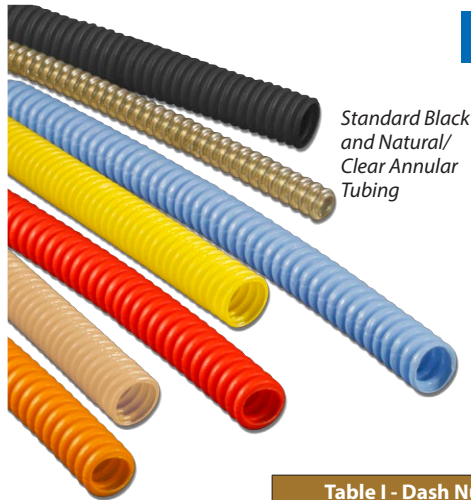
Standard Black and Natural/Clear Annular Convuluted Tubing

Outstanding mechanical wire protection and lubricity for non-EMI/RFI applications