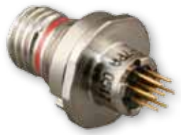
Series 801 Printed Circuit Board Receptacle

Printed Circuit Board Receptacles feature low profile shells for minimum protrusion inside enclosures and integral standoffs for board washout. Contacts are non-removable.