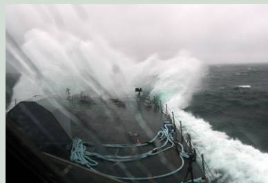
Glenair MIL-DTL-24749 Rev. C Type IV Stainless Steel/Nickel Ground Straps: US Navy qualified and tested to survive extreme environments

Lugs - 316L Stainless Steel/Passivate Braid - 316L Stainless Steel 36 AWG, 50%; 200 Nickel 36 AWG, 50%