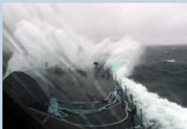
Glenair MIL-DTL-24749 Rev. C Type IV Stainless Steel/Nickel Ground Straps: US Navy qualified and tested to survive extreme environments