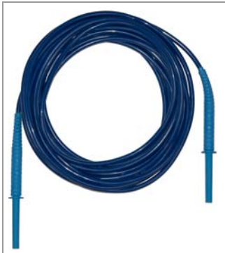
Test adapter AutoISO-5000 (Z555Z)

Measurement leads with safety plugs and alligator clips inclusive