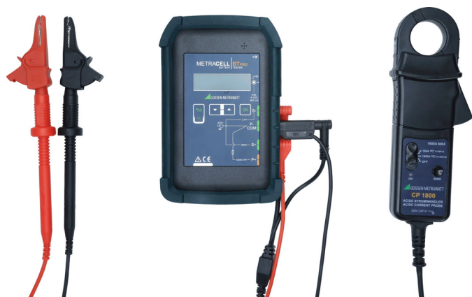
Figure 2: Battery tester with AC/DC current clamp sensor CP1800 (Z204A)