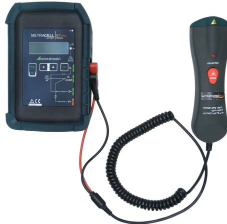
Figure 3: Battery tester with temperature sensor METRATHERM IR BASE (Z680A)