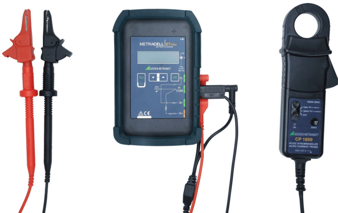
Figure 2: Battery tester with AC/DC current clamp sensor CP1800 (Z204A)