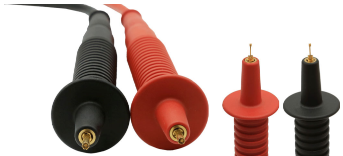
Figure 4: Kelvin probes with spring-loaded contact pins