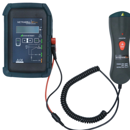
Figure 3: Battery tester with temperature sensor METRATHERM IR BASE (Z680A)