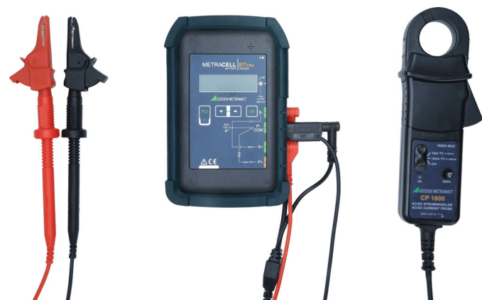
Figure 2: Battery tester with AC/DC current clamp sensor CP1800 (Z204A)