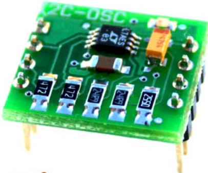
uResearch © 2007 Copyright, All Rights Reserved