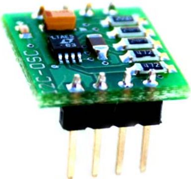
uResearch © 2007 Copyright, All Rights Reserved