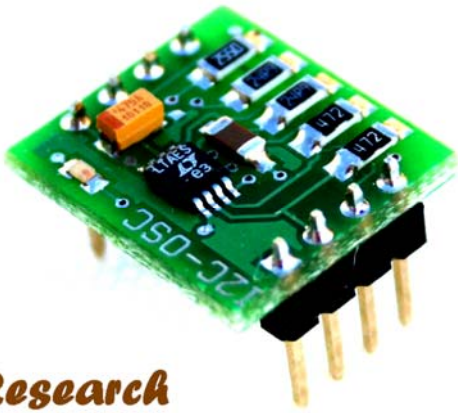
uResearch © 2007 Copyright, All Rights Reserved