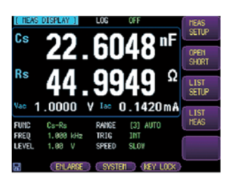
MEAS Display Parameter Setting and Four Measurement Parameters

The LCR-6000 series, within the provided frequency range, features consecutive and adjustable frequency capability which allows users to conduct measurement and analysis on components with the most genuine frequency requirements. For OPEN/SHORT fixture compensation function, the LCR-6000 series is equipped with full frequency range zero and spot zero selections. After executing full frequency range zero, users, under the conditions of not turning off the power and not changing test fixture, can freely change test frequency for the LCR-6000 series to execute component measurements that tremendously saves time in repeatedly zeroing test fixture after changing frequency.