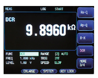
D.C. Resistance Measurement Ideal for inductive components' D.C. Characteristics Verification

To satisfy the diverse measurement application requirements for different components and materials, the LCR-6000 series collocates with many auxiliary measurement functions. For capacitor measurement, Automatic Level Control (ALC) is mainly for component which requires a constant or rated test voltage such as multi-layer ceramic capacitor (MLCC). An internal D.C. bias voltage (±2.5V, internal) is allowing simulating A.C. and D.C.