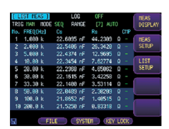
Listed Tests Variation Criteria Based Upon Frequency or Voltage/Current