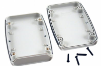
Key Internal Features