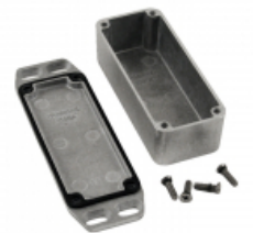
Water-tight versions and gasket upgrades available for most sizes.