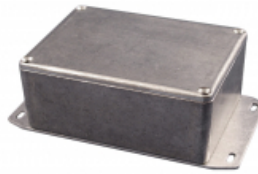
Spot-welded bottom flange