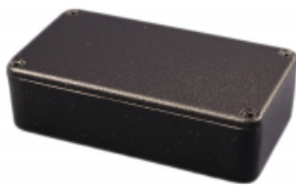
No mounting flanges