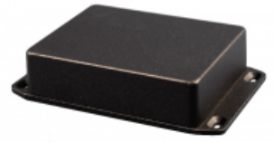
Wall-mounting flange integrated into lid.