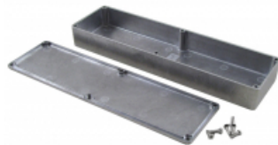
Lap joint construction where lid and box meet.