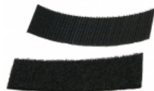
Hook & Loop Mounting Strip 1592ETV