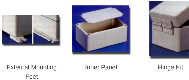
External Mounting Feet