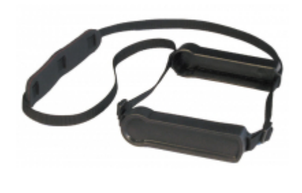
Shoulder Strap & Protective Caps