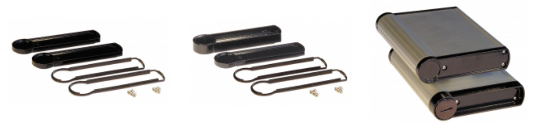
Flat End Plates