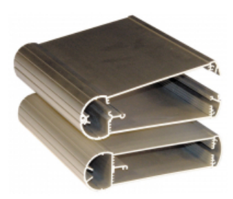
Two piece version - R251 series (top) One piece version - R250 series (bottom)