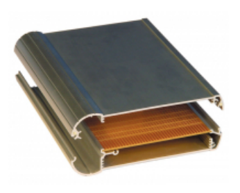
With P.C. Board Mounted (Two piece version)