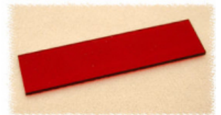
Infrared panel available (special order).