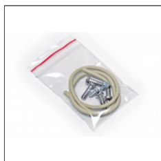
Hardware includes lid screws, PC board screws, and gasket