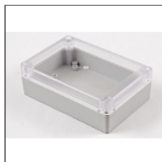
Clear Lid (polycarbonate version shown)