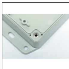
Features corrosion resistant inserts for lid assembly