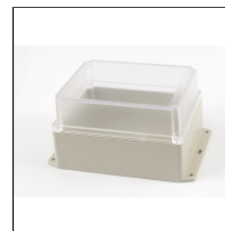
Some models supplied with deep lids.