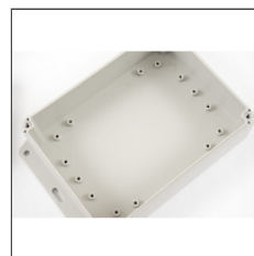
Internal mounting points for PC boards or panels