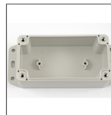
Internal DIN rail mounting point.