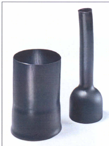
135-1 supplied / fully recovered.

This style is low profile and lightweight. Typically used on airborne harnesses. Rib locates on circular backshell. For VG shapes with portholes "P" please refer to product standards tables in the appendix.