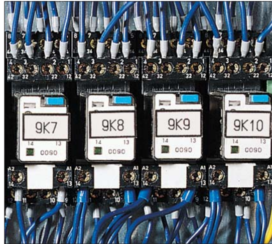
Helatag cotton fabric labels will adhere to most surfaces.

These labels are manufactured from a robust cotton fabric which is easily inscribed and applied. Text remains permanently legible and will not smudge or run. These labels can be removed without leaving a sticky residue. Labels are supplied on A4 sheets with or without a black border. For professional hand inscriptions, we recommend the T82 marker pen, which has fast-drying and UV-resistant ink.