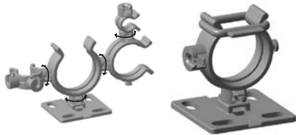
Multiple clips can be joined. Clips swivel freely.