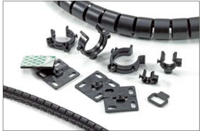
The Helawrap accessory set for bundling, fixing and protecting multiple cable runs.