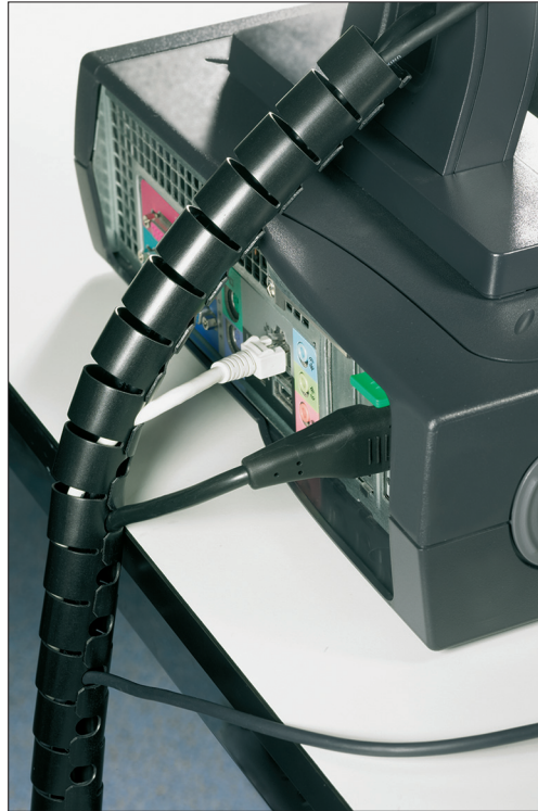
Choice of colours for various home and office environments.

The practical 2 metre Helawrap is designed particularly for domestic and office use. Multiple Helawrap cable covers can be applied in a series to provide continuous protection of even long lengths of cable. 25 metre lengths for large-scale applications are available on request. A handy applicator tool is always included.