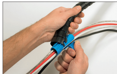
Place the applicator tool in one end of the Helawrap cable cover.