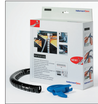
Helawrap, the fast and easy solution to your cable chaos, available in 2 sizes and 3 colours!