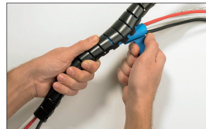
Simply slide the applicator tool through the Helawrap cover.