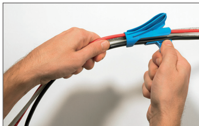
Insert one or more cables into the insertion slot of the applicator tool.