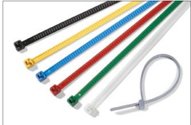
The LR55 cable ties are reusable and ideal for colour coding.