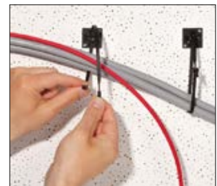
Without additional effort only Q-ties can be used for temporary and final cable bundling.