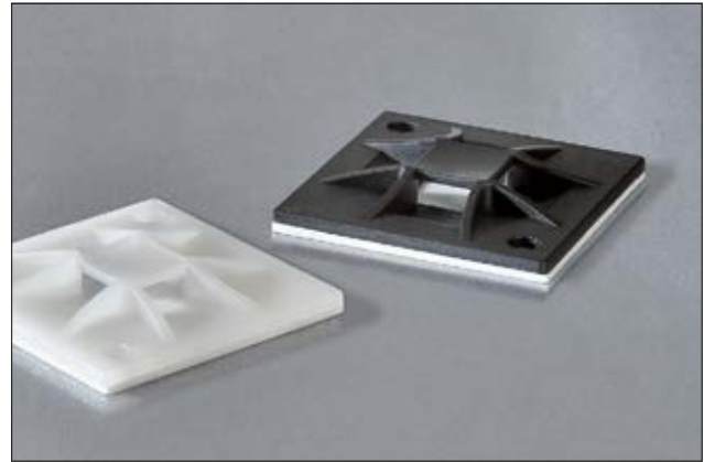
Q-Mount QM, 4-way entry, self adhesive, screwable.