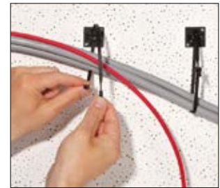
Without additional effort only Q-ties can be used for temporary and final cable bundling.