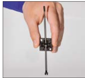
The Q-mount base locks the Q-tie in vertical position, leaving the hands free to apply the cables.