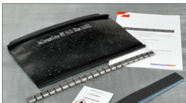
RMS: Repair sleeve, steel closure, abrasive strip, cleaning sachet, instruction sheet.