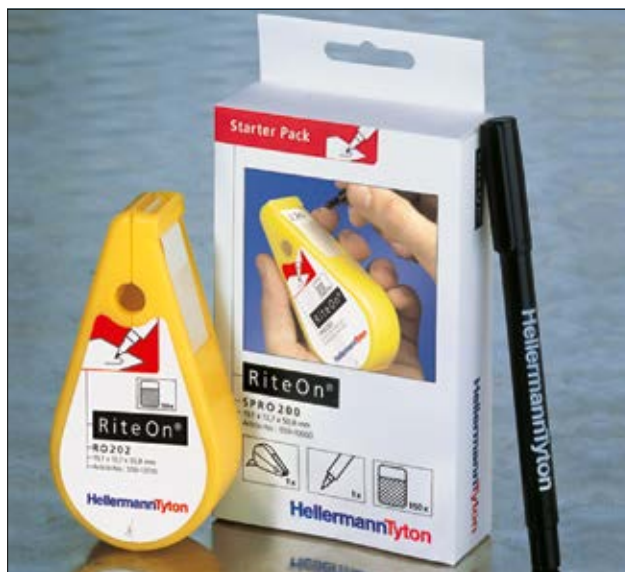
The RiteOn starter pack gets you started right away.