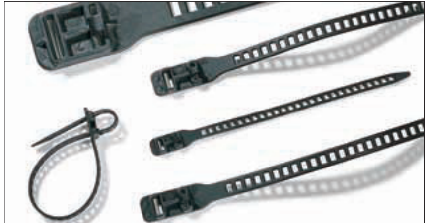
The Elasticity of the SOFTIX ties makes them suitable for use in many applications.

The SRT range offers solutions to numerous bundling applications. The soft, flexible material makes these ties particularly suitable for use on data and fibre-optic cables. The elasticity of the material makes them ideal for securing young trees to support poles, and other applications within the gardening and landscaping industry.