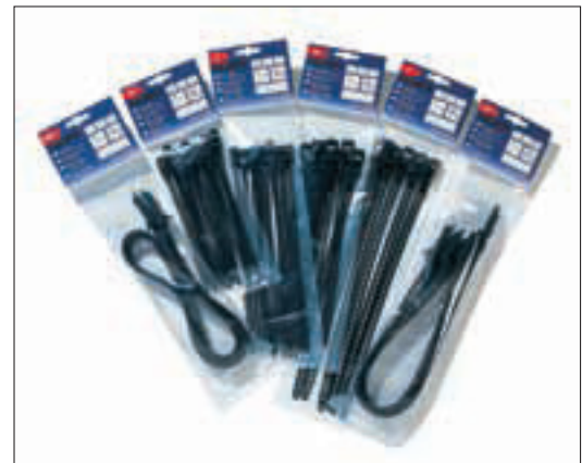
SOFTIX ties available in small quantities.