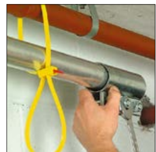
SpeedyTie® is particularly suited for temporary but safe bundling or fixing.