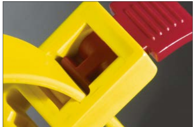
Patented quick release mechanism for quick and easy application.