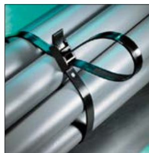
SpeedyTie® – Quick and easy.