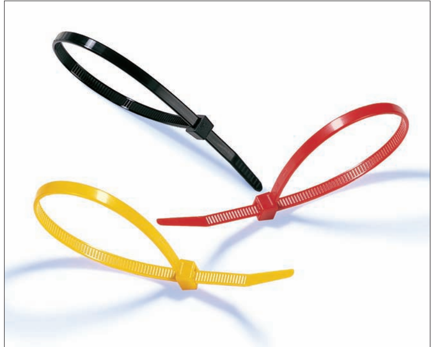
T Series for bundling and securing of cables for a wide range of applications, available in various colours and materials.

For the routing, bundling and securing of cables, pipes and hoses.