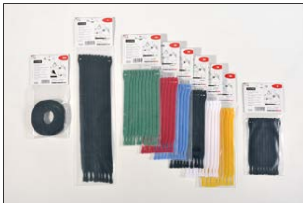
The TEXTIE-Series is available in different colours and lengths.