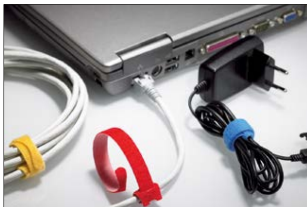
Due to the functional cable tie design the TEXTIE is fixed on the cable and can't get lost.