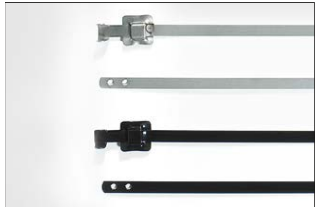
MLT-Series. Releasable Stainless Steel buckle tie with and without coating.