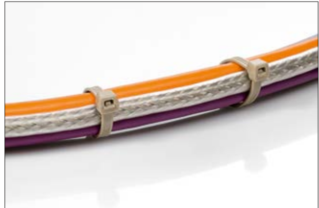
The contoured head takes up less space, gives a low insertion force and offers high strength.