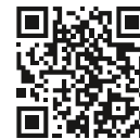
One Step to the Web!