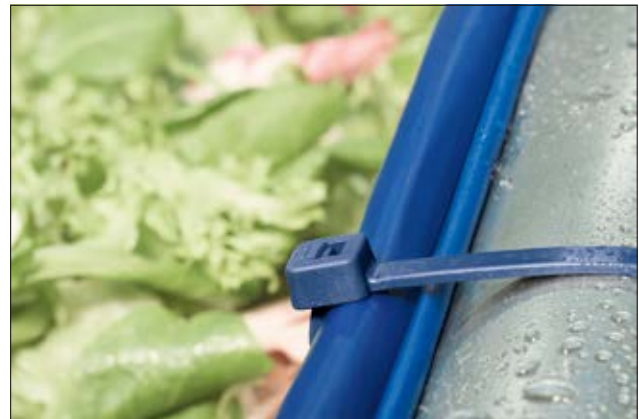
Our detectable MCT(S) cable ties used in the food and pharmaceutical industry.