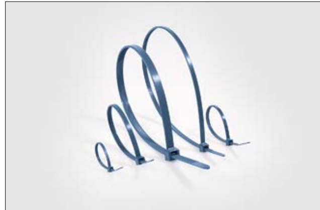
MCTPP ties have a high chemical and temperature resistance.