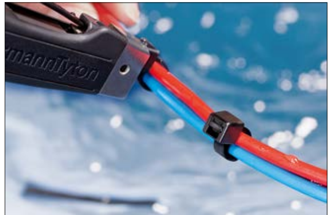
T-Series cable ties for higher chemical resistance and temperatures up to +115 °C (PP).