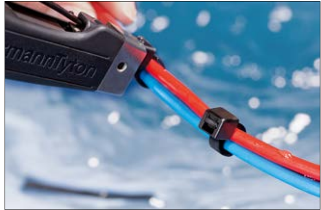
T-Series cable ties for higher chemical resistance and temperatures up to +115 °C (PP).