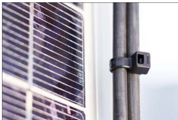
A sustainable T-Series cable tie with high resistance to chemicals and UV light.