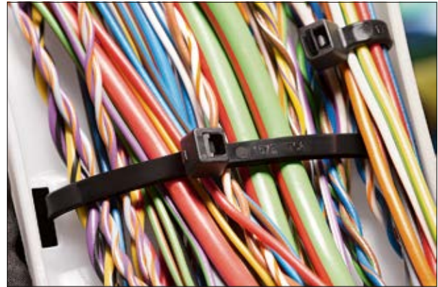
Standard T-Series cable ties – for almost any type of application (PA66).