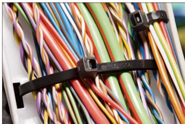
Standard T-Series cable ties – for almost any type of application (PA66).