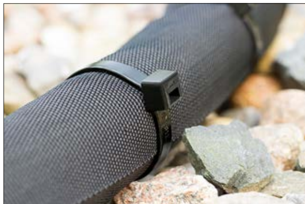
Impact resistant T-Series cable tie (PA66HIR(S)).