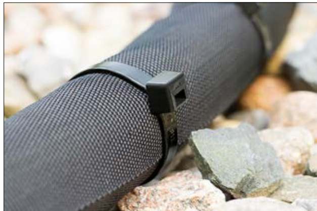
Impact resistant T-Series cable tie (PA66HIR(S)).