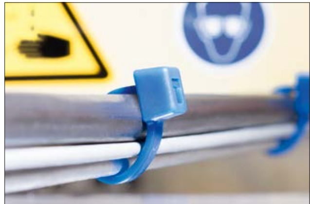
T-Series E/TFE cable ties – for higher chemical resistance up to +170 °C.